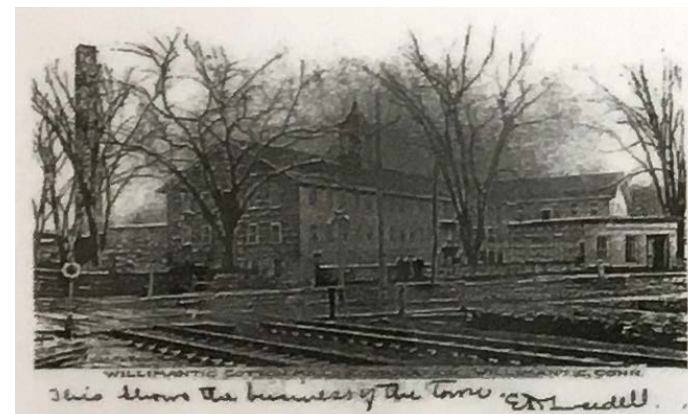
Photograph of the Smithville Mill on the site